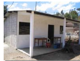
Adprosa in Guatemala uses a system in which a core unit is built in 14 days,

Key to success in the provision of HSS is good institutional arrangements.