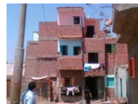
A new, three storey home built with support from Habitat for Humanity in Egypt.

The afternoon working groups asked participants to think about, and challenge a number of myths that surround the provision of HMF in the region. The following table summarises the discussions of the three groups: