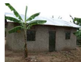
A UGAFODE house in Uganda: Phase 1 = US$400 for roofing; client moved in. Phase 2 = US$200 for strong metallic shutters. Phase 3 (current loan) = US$ 200 for plastering (underway).