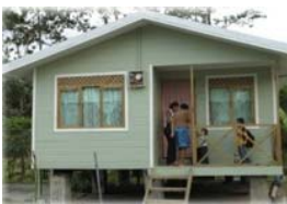
A house built with support from Fuprovi, in Costa Rica. Families contribute approximately 40% of the cost of the house with their labour.

Key to success in the provision of HSS is good institutional arrangements.