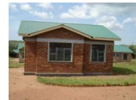
A Mwanza house in rural Tanzania, built with burnt bricks using agro-waste.

The successful use of innovative and relatively new technologies depends upon local community buy-in.