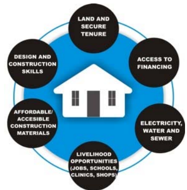
The approach to HSS by Prodel, in Nicaragua.

Our understanding of HSS is often limited to the provision of Construction Technical Assistance (CTA). Depending on the context and the capacity of the provider, HSS may also address market constraints such as tenure insecurity, poverty and unemployment, poor public investment in infrastructure, and community development.