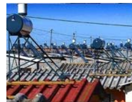
Solar water heaters are safe and energy efficient, and can be financed with HMF. They also offer a business opportunity for micro franchisees.

The successful use of innovative and relatively new technologies depends upon local community buy-in.