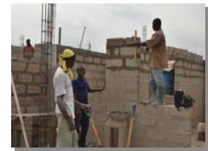
Amui Dzor Project, Tema, Accra, Ghana – supported by UN Habitat and the TAMSUF Local Finance Facility.

UN Habitat's overall expectation of the HMF lenders or programmes it funds is a viable business programme that is suited to the region and local demand. The organisation's financial assets must be consistently underwritten. Critically, borrower financial education and community outreach must be included as part of the programme, whether offered directly by the institution or through partners. Savings schemes eliminate moral hazard and add to credit quality. In making their assessment, the Urban Finance branch reviews the institution's products, processes, projects, loan portfolio and capital structure.