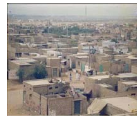
Staged, pre-planned incremental housing in Saiban, Pakistan

4. There is a need to distinguish between unassisted progressive housing and staged, pre-planned incremental housing. While the former often involves informal, ad hoc construction practices, the latter involves specific, identifiable steps, each financed with a loan, which together add up to a quality housing product. Pre-planned incremental