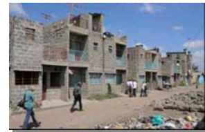
A vertical incremental housing project by Pamoja Trust and supported by Homeless International, in Huruma, Nairobi, Kenya.

HSS methods should also be developed to enable the high-density developments and better urban form.